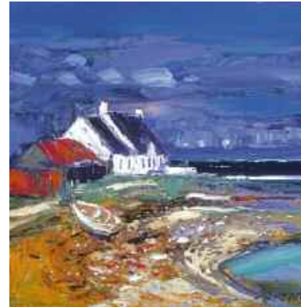
JOCK'S CROFT ISLE OF TIREE