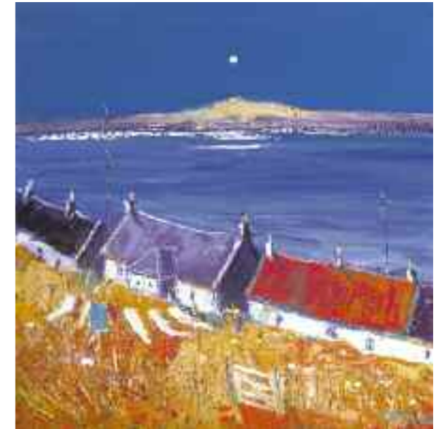
WASHING LINE BACK OF ARINAGOUR ISLE OF COLL