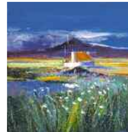
CROFT ON THE MACHAIR SOUTH UIST