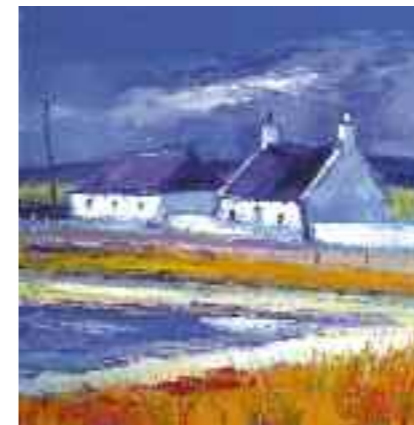
SUMMER LIGHT AT BLACKROCK ISLAY