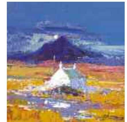
BEN TALLA ISLE OF MULL