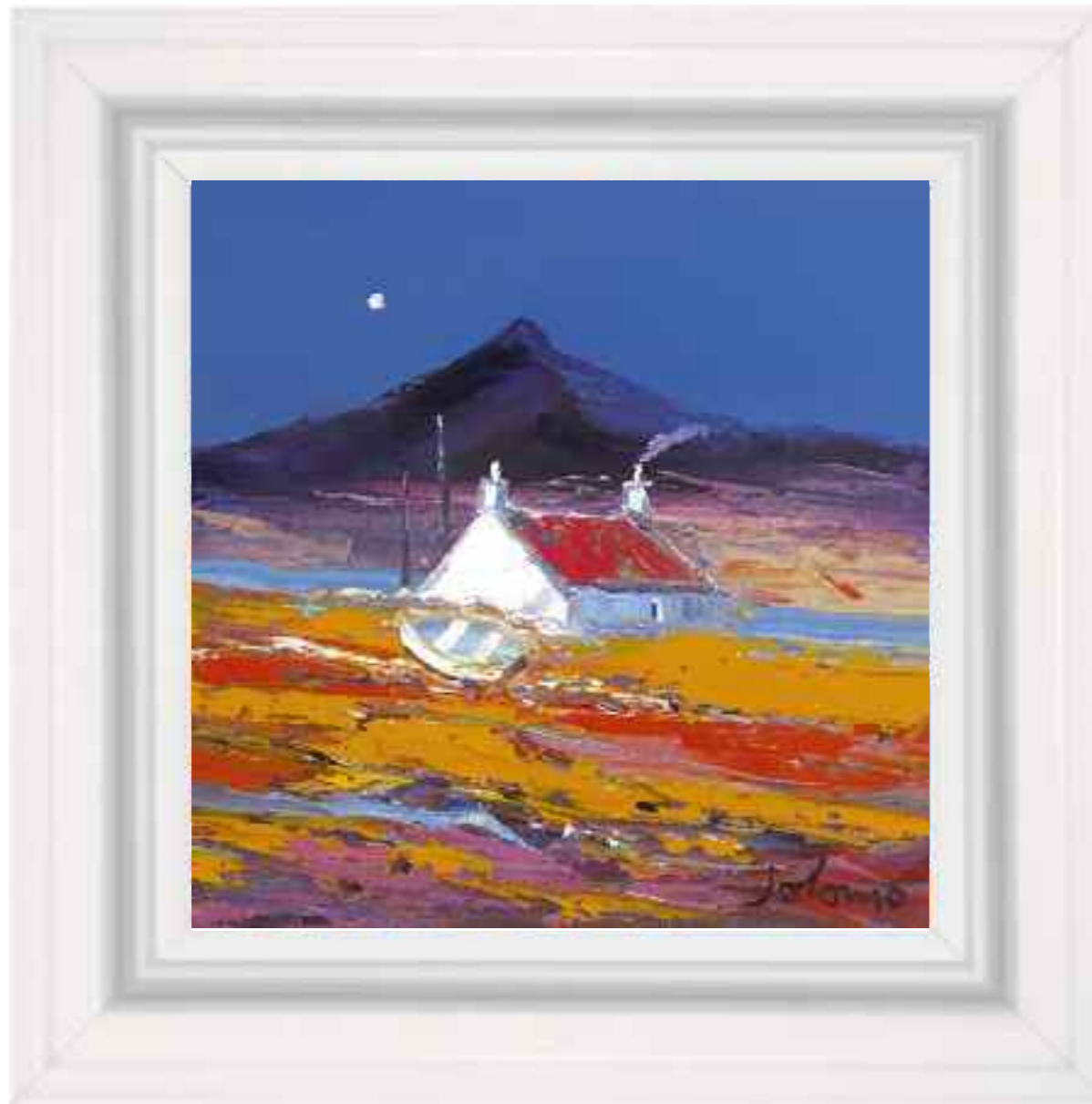
Hand Embellished Canvas, Edition Size 295, Size 12" x 12", Framed £250