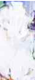
BEN TALLA ISLE OF MULL