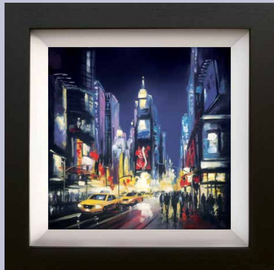
ambientcity I NEW YORK

Hand Embellished edition canvas of 195 Size 14" x 14" Framed £285