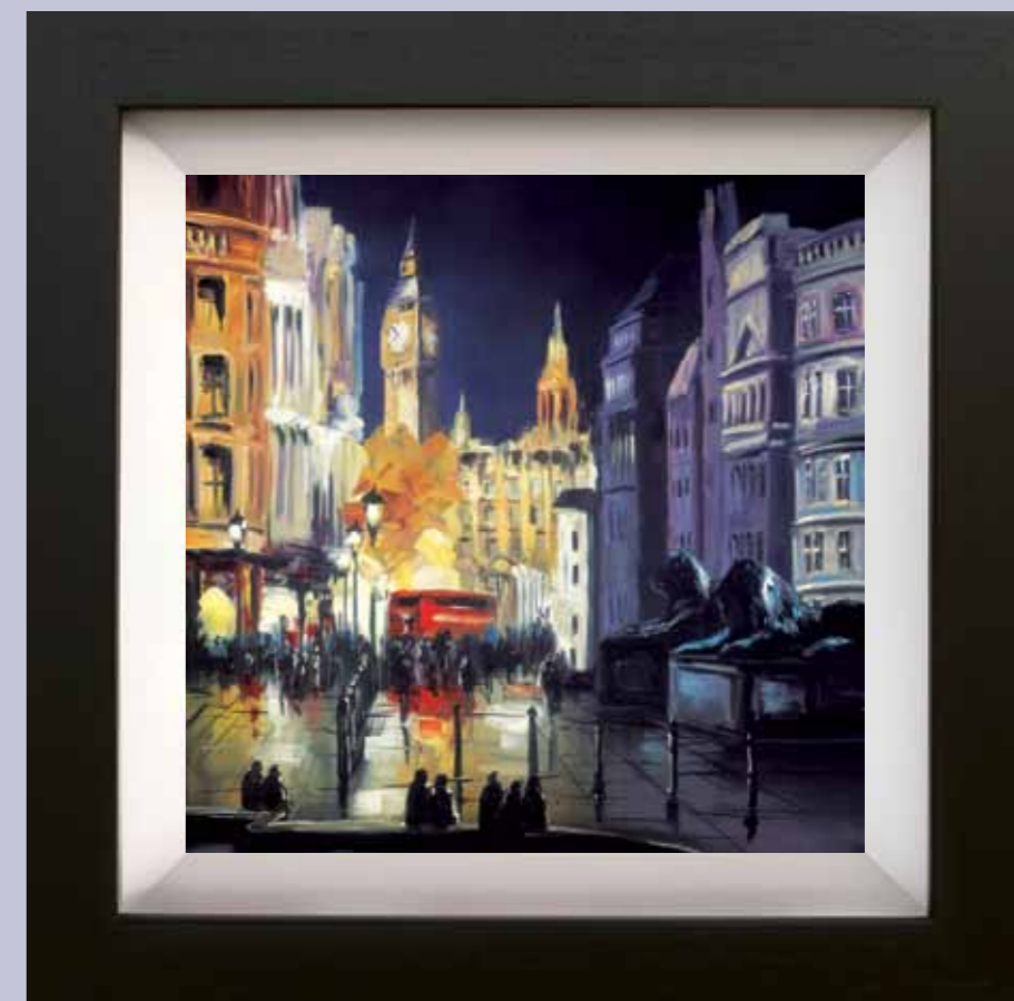
ambientcity IV LONDON

PARIS Hand Embellished canvas edition of 195 Size 14" x 14" Framed £285