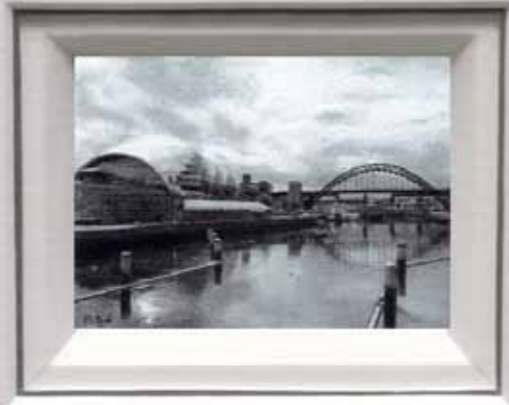
G a t e s h e a d M i l l e n n i u m B r i d g e I