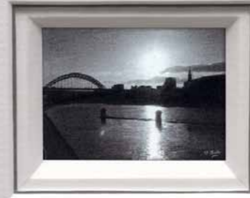
G a t e s h e a d M i l l e n n i u m B r i d g e I I